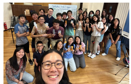
Youth Games - Virtual Tournament