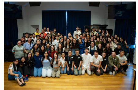
Two-gather - Combined Event with SACM