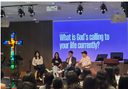
Panel on Answering God's Call

Even on weeks when there was no formal youth service, we sought to remain connected and to share life together. We organised various bonding activities, including ultimate frisbee, table tennis, an escape room outing, and even an e-games tournament. These moments of play and fellowship allowed our youths to build friendships, deepen trust, and experience joy together as a community.