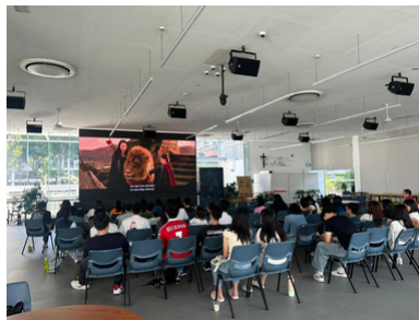
Youth Sunday - Movie Screening