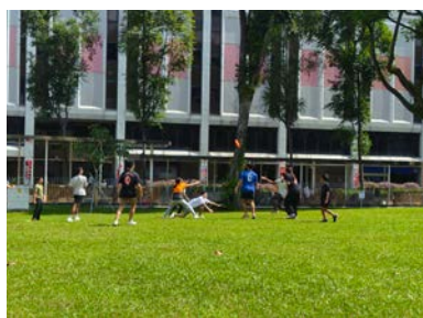
Youth Games - Ultimate Frisbee