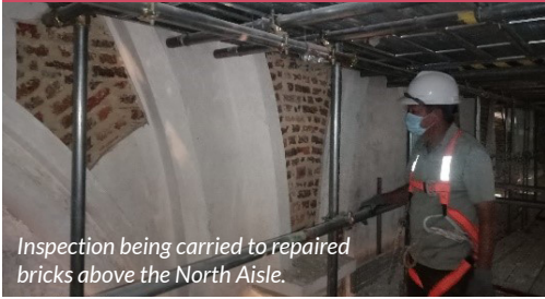
Inspection being carried out to repaired bricks above the North Aisle.

Plastering works stretching from the Choir stall to the back of the Nave are almost completed. A final inspection will be done in early August, before painting commences. Brick preparation works are now ongoing along the North and South Aisles; and plastering to these areas will also commence in early August.