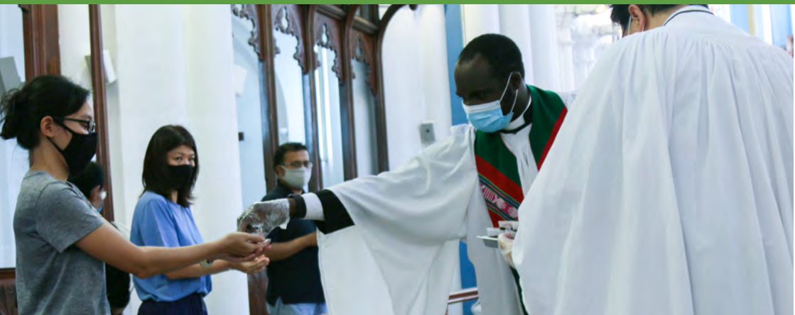
Receiving Holy Communion at the Congregational Worship Service (CWS)