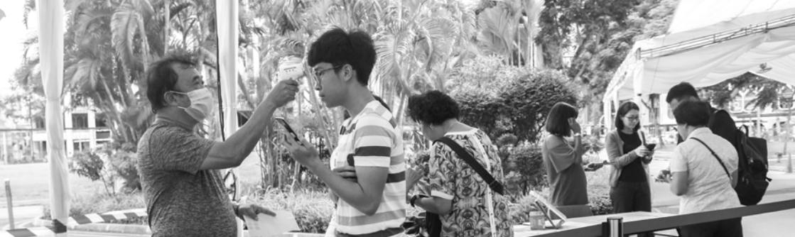
Contact tracing and temperature checks before the Sunday 5pm Service