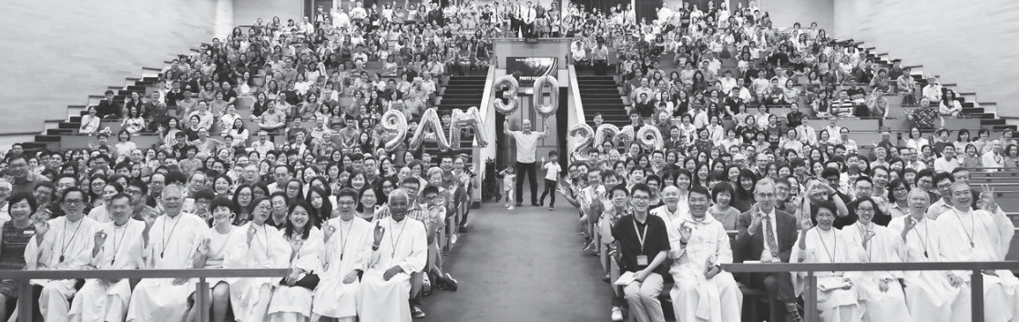
The 9am Service celebrated her 30th Anniversary in 2019