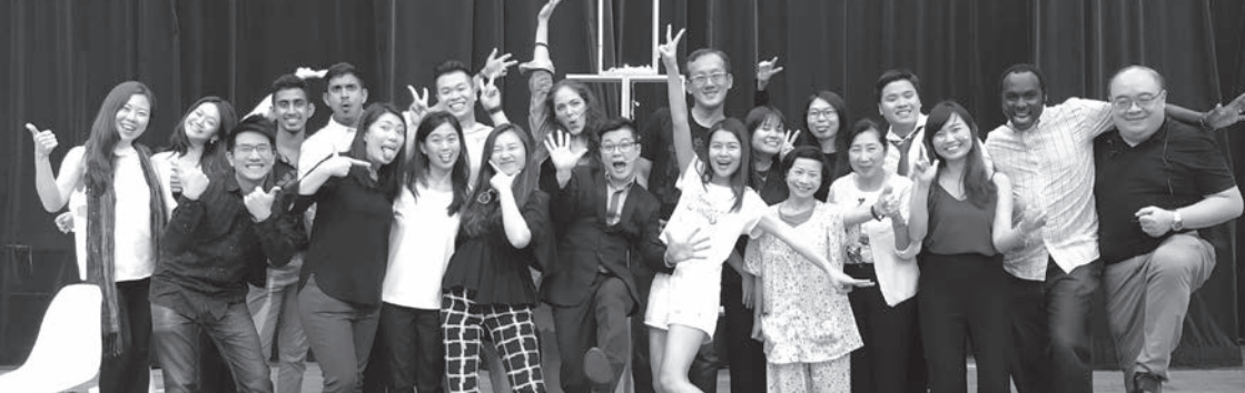
Cast and crew of the Christmas drama 'Love meets You where You are'