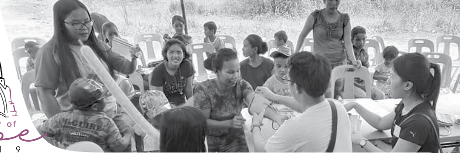
Healthcare screening at Batam Medical Outreach