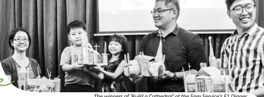
The winners of 'Build a Cathedral' at the 5pm Service's F1 Dinner