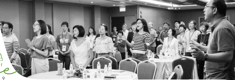
Alpha Weekend Away