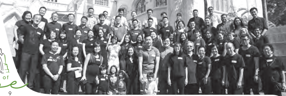
Baptism candidates at the Saturday 4.30pm Service on 24 August 2019