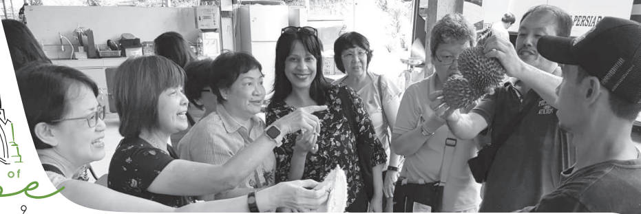
CWF durian trip to Johore