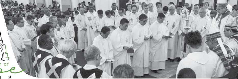
Ordination Service, 7 July 2019