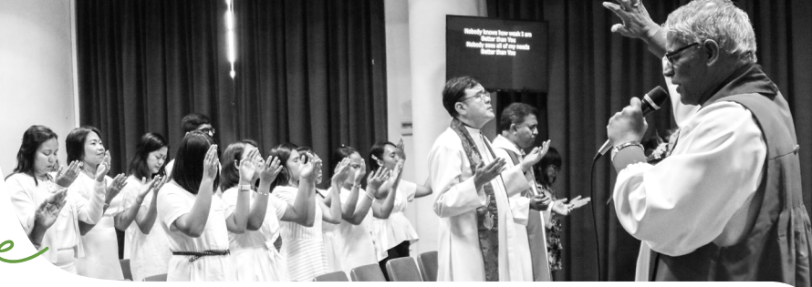
The first Confirmation Service at the Filipino Service on Sunday, 30 June 2019