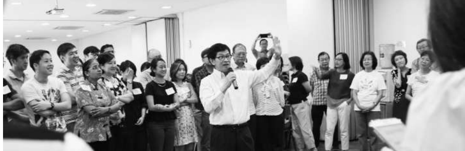
Connect group leaders' training