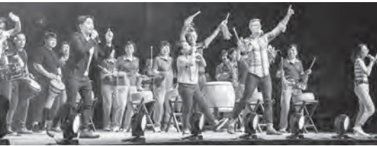
Leading in worship at the English/Filipino rally

And greater was the joy, when their guests responded to the message. This is precious: the experience of inviting someone to explore the faith. This entails a measure of boldness to invite and to overcome the awkwardness of conversations about the faith. In so doing, we plumb the depths of human relationships as we go beneath the superficial layers.