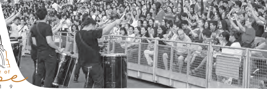
Celebration of Hope