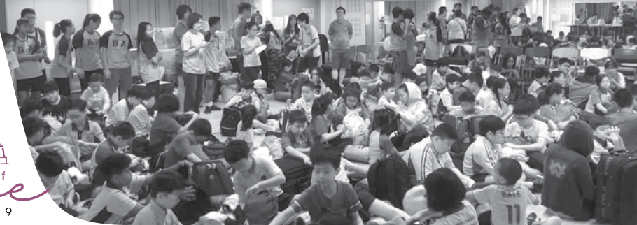
CITY Orientation Camp at White Sands Primary School