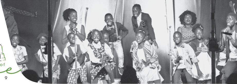
Watoto Children's Choir