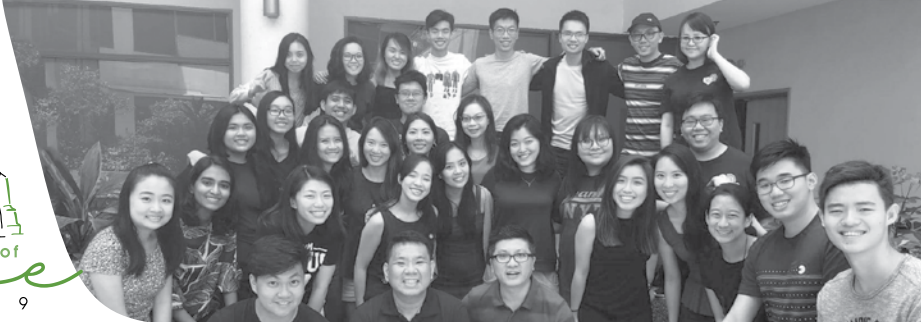
Eleven30 ministry retreat, 25 & 26 Jan at YWCA Fort Canning Lodge