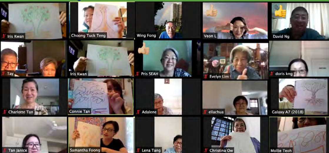
The Senior Members' Fellowship online session on 'Self-Care Through Art'