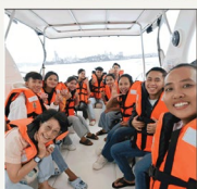
Taking Hospitality students to Song Saa Private Island for work experience