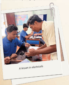
A lesson in electricals