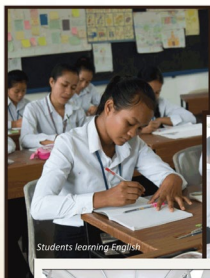
Students learning English

(change of venue due to DOS Chinese Board Lent Service Series)