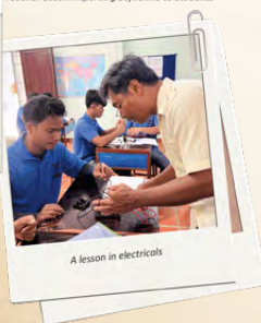
A lesson in electricals