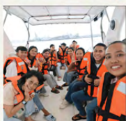
Taking Hospitality students to Song Saa Private Island for work experience