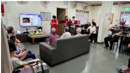
Cathedral Women's Fellowship monthly activity at the Home

St Andrew's Cathedral Home is a residential home in Clementi for ambulant older women and provides services to the underserved.