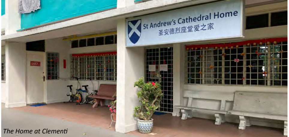
The Home at Clementi