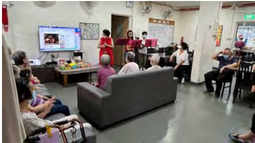
Cathedral Women's Fellowship monthly activity at the Home

St Andrew's Cathedral Home is a residential home in Clementi for ambulant older women and provides services to the underserved.