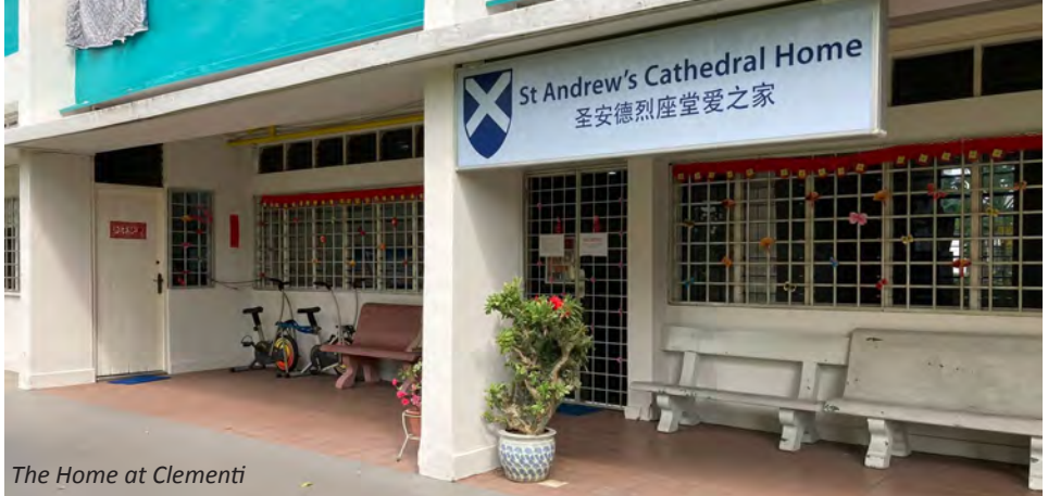
The Home at Clementi