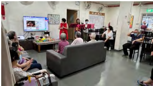
Cathedral Women's Fellowship monthly activity at the Home

St Andrew's Cathedral Home is a residential home in Clementi for ambulant older women and provides services to the underserved.