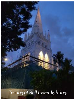
Testing of Bell tower lighting.

Almost all the external scaffolds have been removed, and the internal scaffolds too. Tiling works are in progress inside the Nave, whilst floor polishing works in both the North Transept Hall and South Transept Hall are nearing completion. We have moved on from mainly masonry and painting works to fitting works, carpentry and M&E works as well as cleaning up works. The following works will be carried out in the Nave from November:-