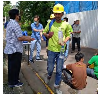
Sharing the Love of Christ with the workers during this Christmas Season.

Progress has been slow in December. The workers need materials that have yet to arrive, such as lime plaster. We are in discussion with the various suppliers and the main contractor, and we hope to resolve the delay in the supply of materials soon. The workers affected by the shortage of materials are presently working at the bell tower.