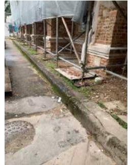
Right: Brick surface preparation completed

are still ongoing. We hope to have the final skim coat done to some of the walls at the east, north and south sides soon.