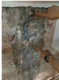
Left: Brick surface inspection

Plastering works to the north side of the building are in progress. Bricks surface preparations at the south side