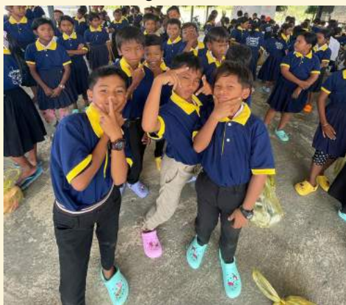
Children showing off their new shirts and Crocs shoes at Trang.

Click on the link https://cathedral.org.sg/jopm for the full Mission Report with photos and video clips.