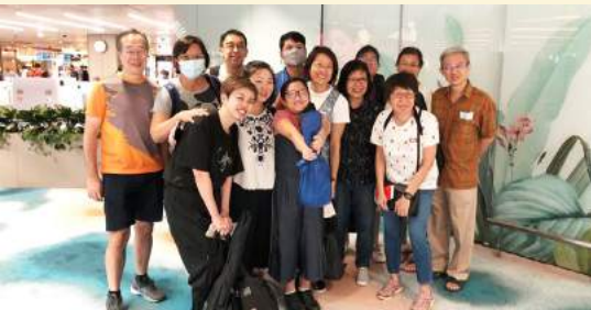
The team with their families at the airport