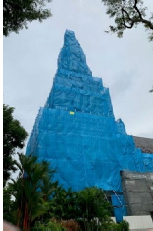
Right: The St Andrew's Cross at the top of the steeple