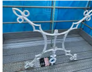
Right: The St Andrew's Cross at the top of the steeple

as they face different challenges along the way and showing them how He wants it done. While we are working closely with the Contractor's senior management to minimise the completion delay, it is currently difficult to estimate the expected completion date, and we may have to continue holding our worship services, weddings and other events in the CNS, Pavilion and other alternative venues for at least part of 2023.