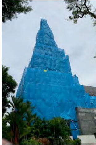
Above: Bell Tower Scaffolding Completed

Please continue to pray for the Main Contractor, Shanghai Chong Kee and all its staff and workers as well as our consultants as they continue to work on completing the restoration works well. Pray for our Good Lord to be alongside them, guiding them