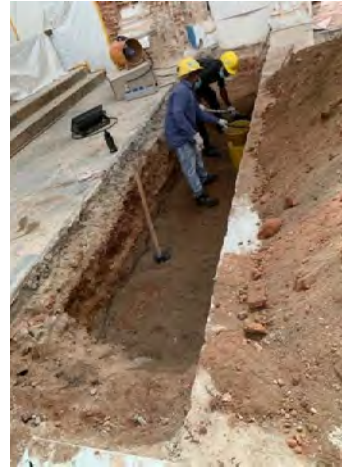
Above right: Trenching works