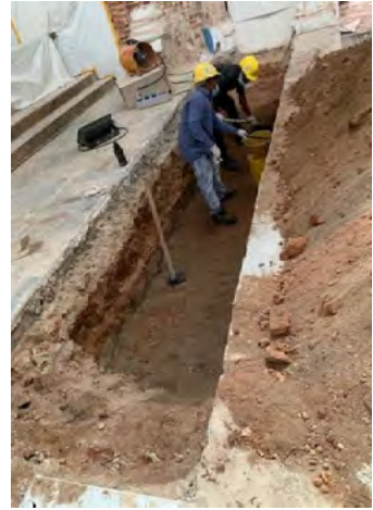
Above right: Trenching works