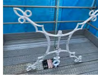
Right: The St Andrew's Cross at the top of the steeple

as they face different challenges along the way and showing them how He wants it done. While we are working closely with the Contractor's senior management to minimise the completion delay, it is currently difficult to estimate the expected completion date, and we may have to continue holding our worship services, weddings and other events in the CNS, Pavilion and other alternative venues for at least part of 2023.