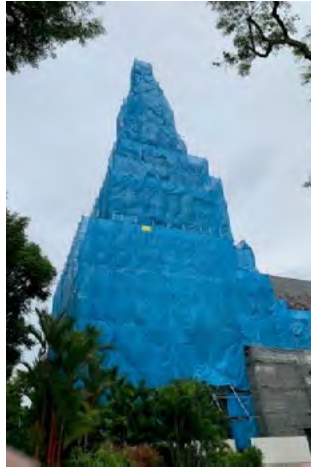
Above: Bell Tower Scaffolding Completed

Please continue to pray for the Main Contractor, Shanghai Chong Kee and all its staff and workers as well as our consultants as they continue to work on completing the restoration works well. Pray for our Good Lord to be alongside them, guiding them