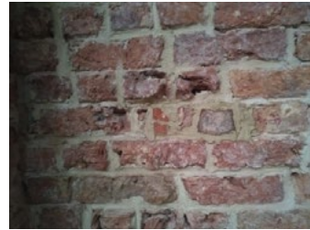
Right: Brick replacement

and we pray that the trenches will be ready by the end of October, so that the laying of the electrical cables can commence.