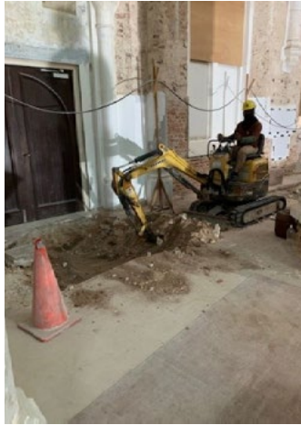
Above left: Trenching works

Trenching works inside the Nave has commenced