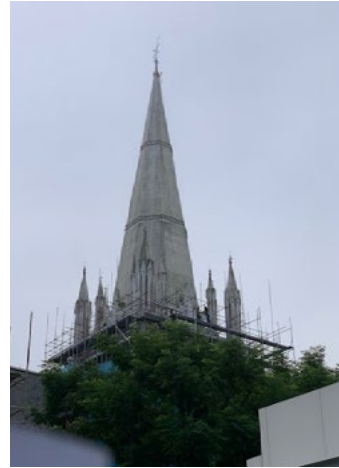
Above right: Scaffolding reaching the top