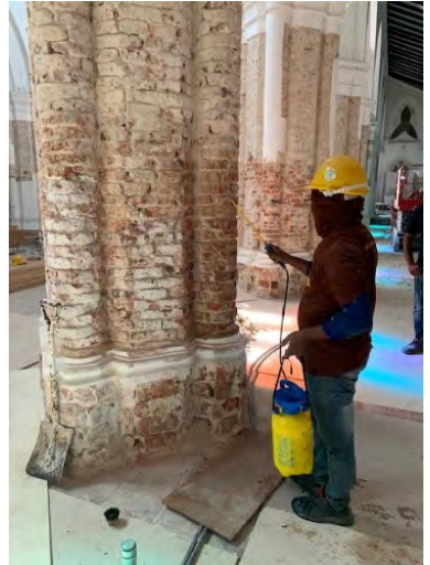
Biocide treatment on exposed wall of bricks

Please continue to pray for God's favour over the restoration – for skilled workers to be available, a safe and peaceful environment for the work to continue, minimal disruptions and distractions from internal and external sources, and wisdom and practical abilities for the project teams to give of their best to this work. “Unless the LORD builds the house, the builders labour in vain” applies very much to the restoration of the Cathedral Nave.