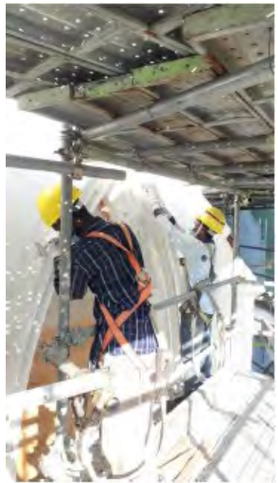
Paint removal external